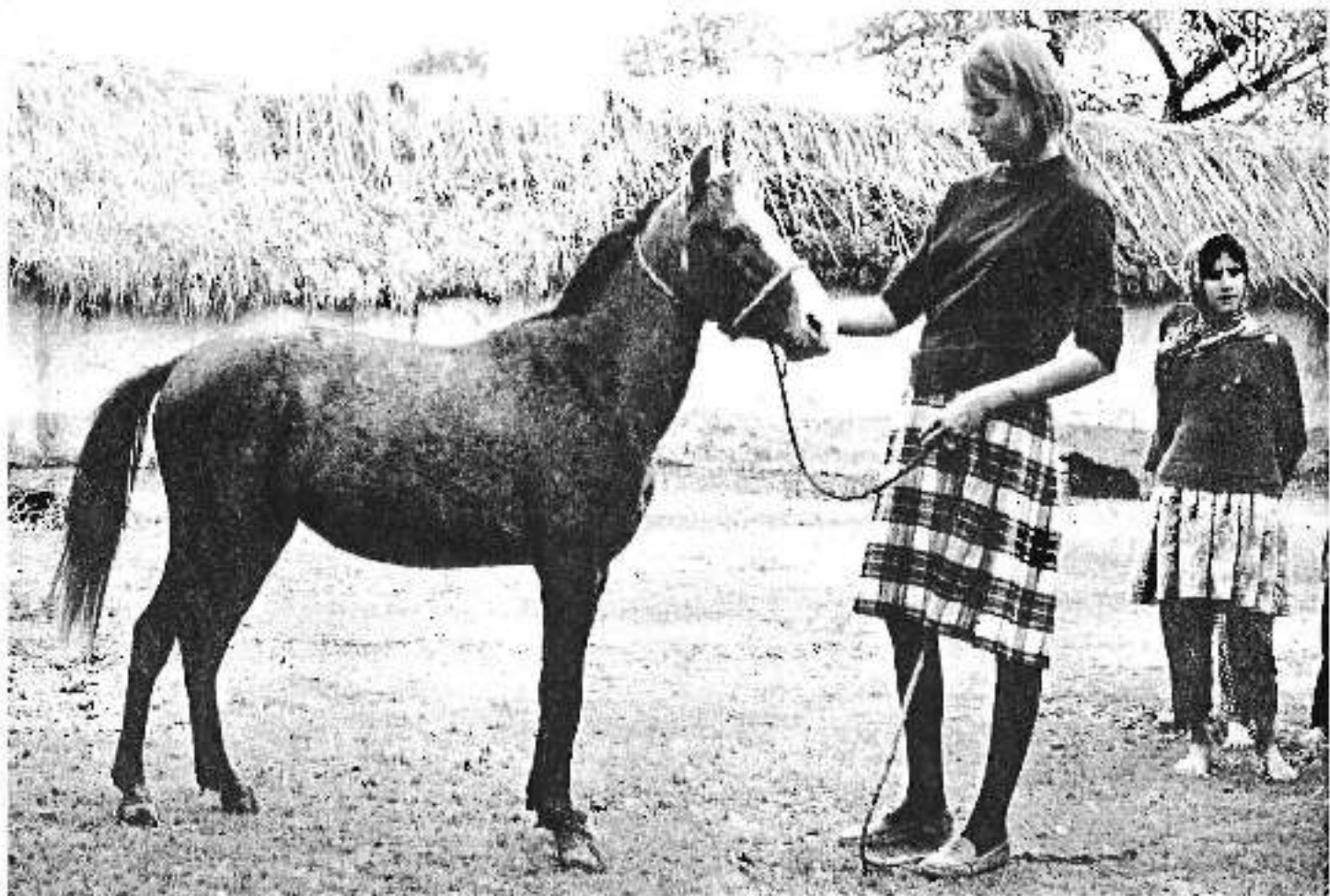
The author with a Caspian pony: she has undertaken a project to preserve this rare breed at her farm near Teheran

has been preserved, making travel from the main road a slow and often arduous business – as we ourselves experienced in the course of the inspections we made at towns along the coast road, at different times of the year. These visits were later followed up with trips on horseback to likely villages and grazing grounds.