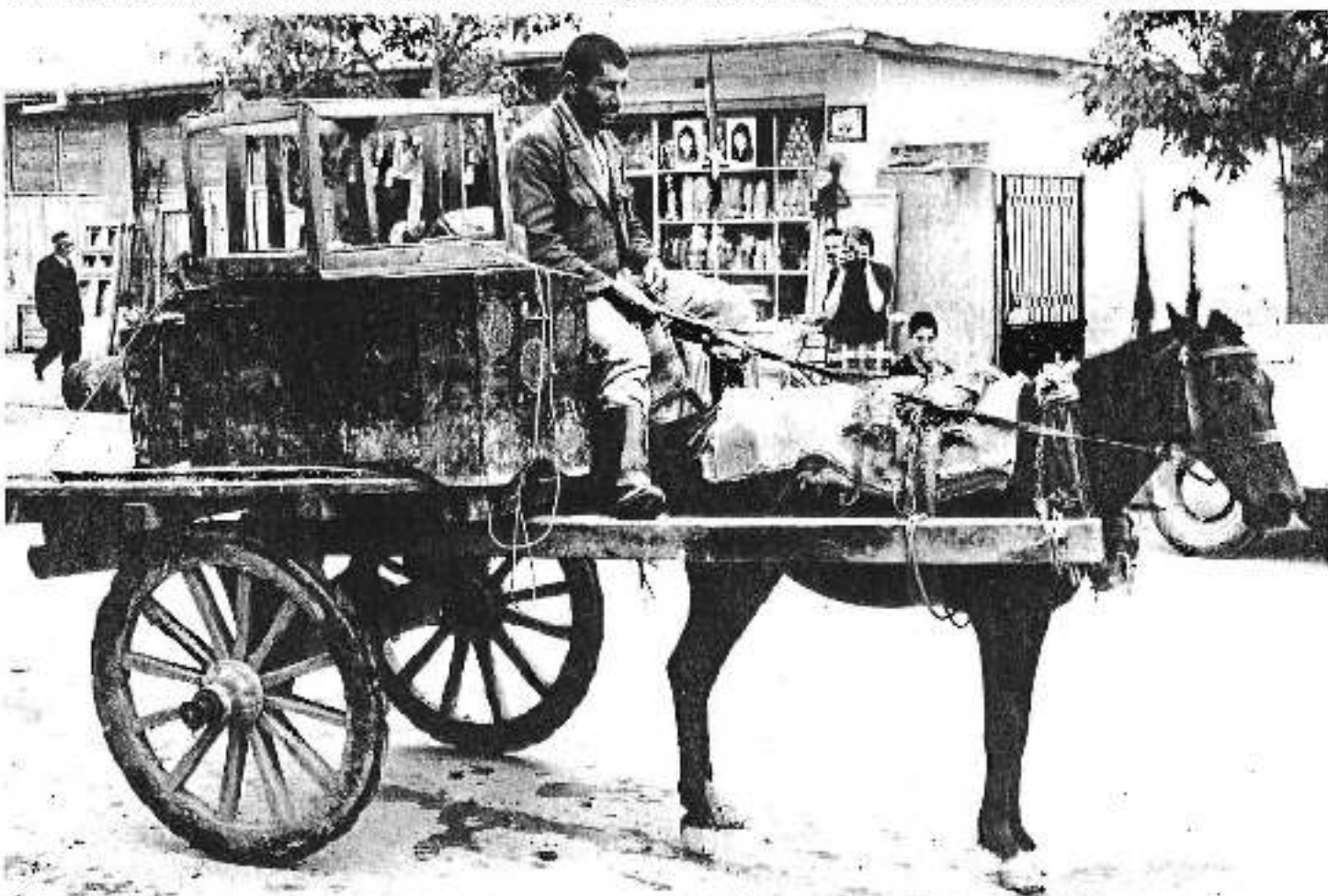
The Caspian pony may seem an unlikely cart-horse, but its speed makes it a more useful draught animal than a donkey

If this were achieved succeeding generations of the Caspian pony born at Norouzbabad will illustrate the similarity more accurately, and should the proof of over 3,000 years of continuity of this curious breed be established, our Caspians will be available for study as living specimens. ●